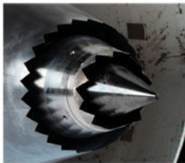
Just plane brilliant? Chevron nozzles (left) reduce the sound of exiting jet engine exhaust.

Jet engine noise comes predominately from two sources. An approaching jet creates a high-pitched whine as the fan pulls air into the engine. As the jet passes by, a low-pitched rumble is created by exhaust leaving the engine.