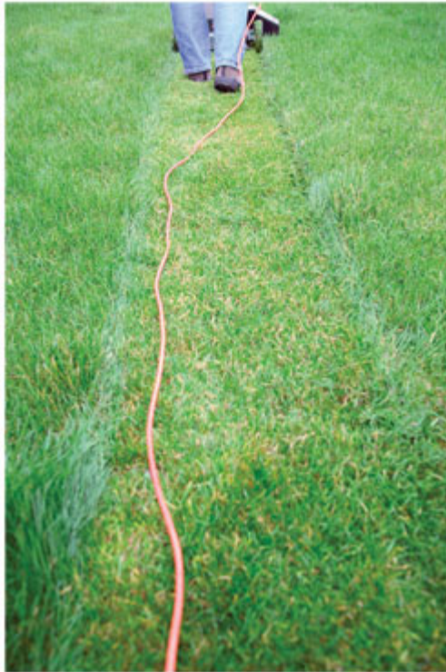
Cutting with cords. Electric lawn mowers can produce sound levels as low as 68 dBA.

"The average life of the lawn mowers and weed trimmers in the United States today is about seven years," says NPC executive director Les Blomberg. "By 2011 most of today's stock will be in the recycle heap. There is a tremendous opportunity to reshape our neighborhood soundscapes by reshaping the lawn and garden marketplace."