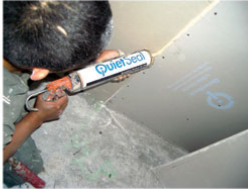
Caulk for quieter walls. New drywall and caulk are engineered to muffle building noise.

Quiet Solution's breakthrough product line of drywalls, caulks, tiles, and other materials employs a viscoelastic polymer that converts sound waves to harmless heat. The polymer kills vibration and is more effective with successive layers applied. The ability of building materials to reduce sound transmission is typically classified according to "sound transmission class," or STC. Typical interior wall construction using wood studs sheathed in drywall has an STC rating of 30-34. By adding a 5/8"-thick sheet of Quiet Solution drywall to both sides of an existing wall, the STC rating jumps to 56, which translates into an 86% perceived sound reduction. In new construction, it is possible to obtain an STC rating of 70 using two layers of wood studs and a layer of Quiet Solution drywall on each side.